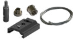
Single wire adjustable suspension kit for LV TRACK.