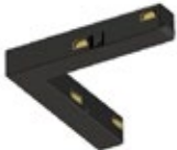
Electrified 90° joint.