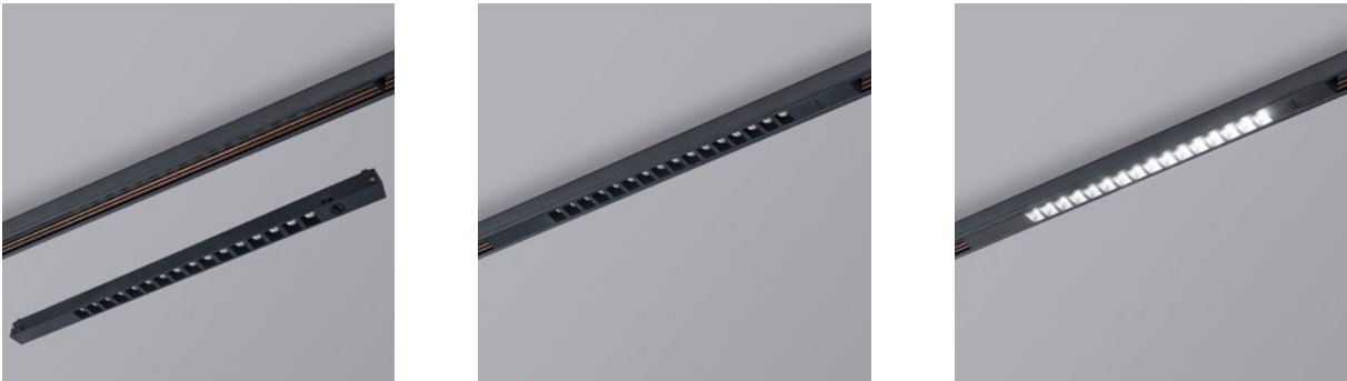
Low voltage track