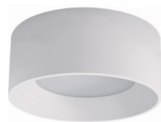
HALL LED ESSENTIAL CEILING